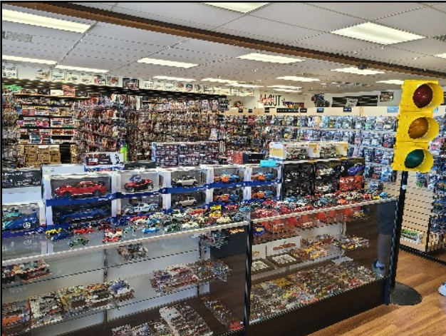
LES STERN'S DIECAST TOUR