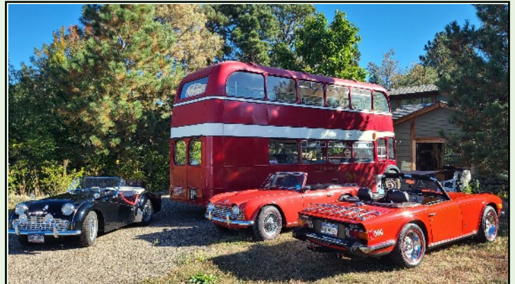
LES STERN DIECAST TOUR