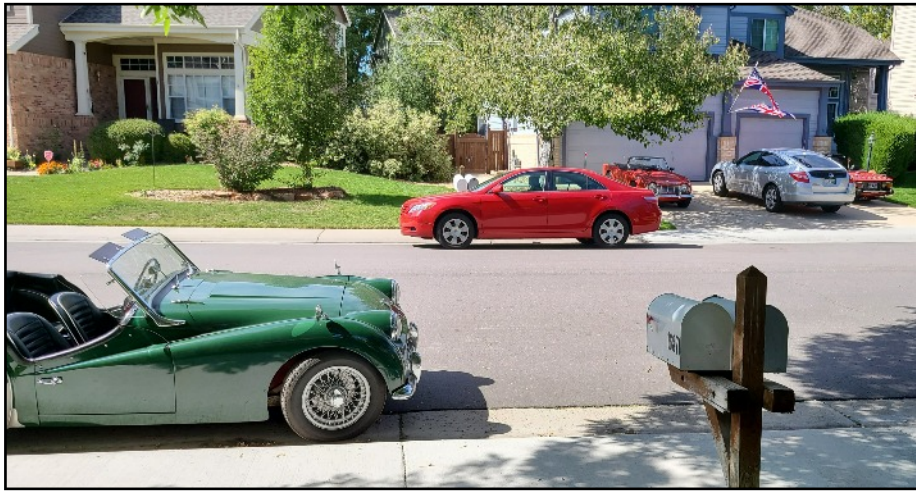
BOSH HOSTS THEIR ANNUAL OCTOBERFEST GATHERING