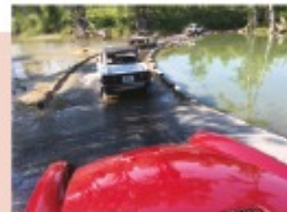
Enjoy the roads at the Gateway to the Hill Country

Join the Hill Country Triumph Club of Austin as we celebrate