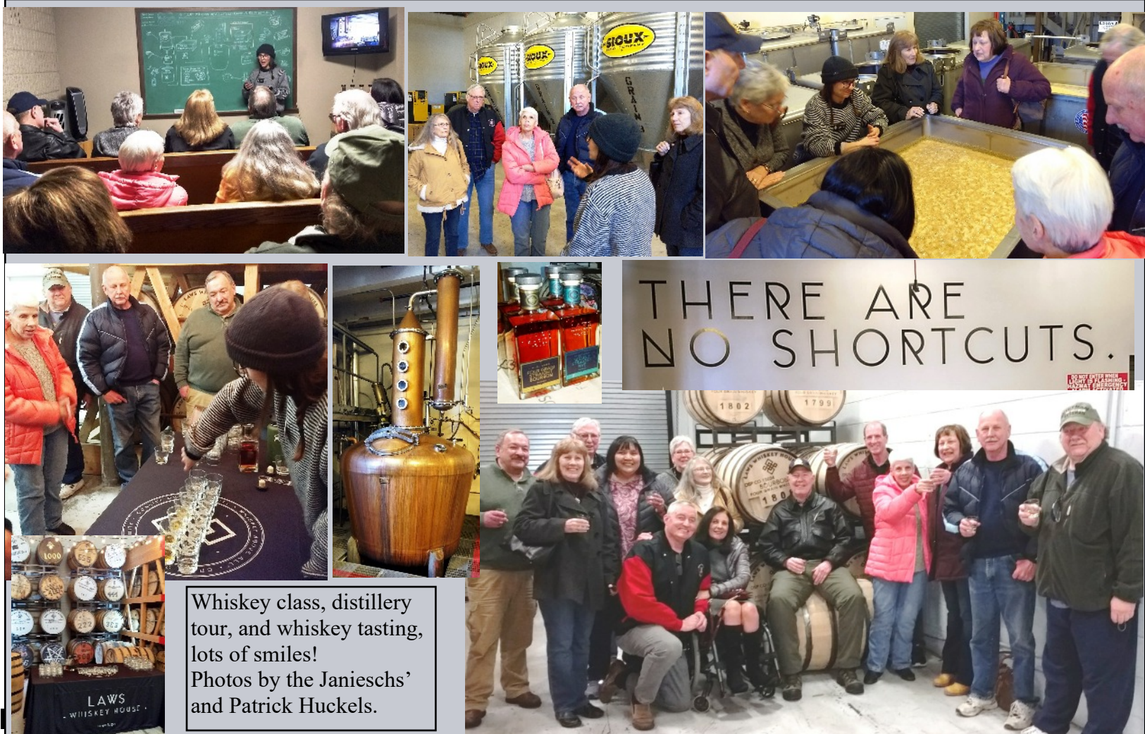
Whiskey class, distillery tour, and whiskey tasting, lots of smiles!