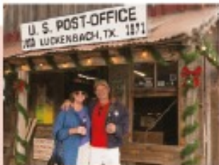
Visit Luckenbach, TX With Willie & The Boys

Join the Hill Country Triumph Club of Austin as we celebrate