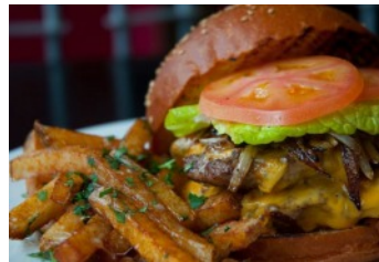
TAG Burger Bar