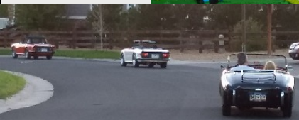
← Enroute to the family photo.