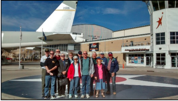
Thirteen RMTC club members with 5 TR6's and 2 Miata's attended Wings Over the Rockies on Saturday, March 24 th .