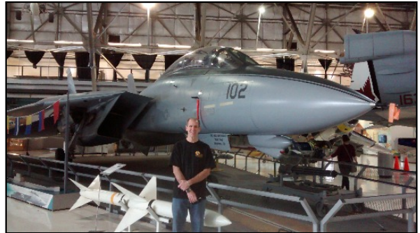
Real F14s for the adults!