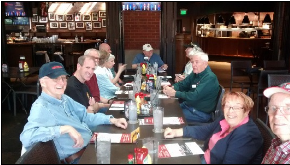
The group of "youngsters" were all carded during our lunch at The Tavern Lowery. Lots of laughs, great company and tasty food!