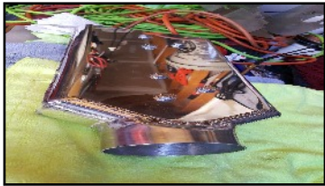
Used Goodparts air housing box for dual 175 CD Stromberg carburetors for TR250 & TR6. $100.00