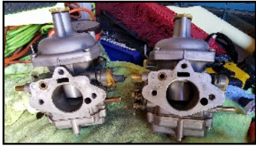
Used 175 CD Stromberg carburetors. $75.00 each