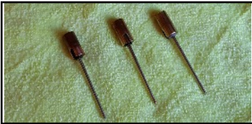
New adjustable BIAF metering needles for Stromberg 175 CD carburetors for Sale. $22.00 ea.

1976 Triumph Spitfire 1500, 61,000 miles. I have worked on this car alot over the last 17 years, driven it very little. Less than 1000 miles on the following: Professionally rebuilt higher performance engine, 4 carb PRI setup, headers, monza exhaust, HD 3 row radiator, additional electric fan. Replaced brakes, master and slave cylinders, clutch, shocks, fuel tank, bushings, bearings, seals, tires, etc. Rebuilt differential, HD starter, HD rear spring, needs some TLC aesthetically. Original soft top, original pimento paint, body ok, minor dings & scratches, original upholstery & carpet, needs body seals. $5500.