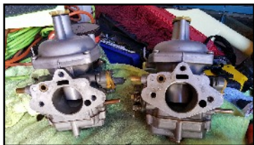
Used 175 CD Stromberg carburetors. $75.00 each