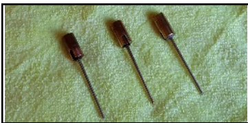
New adjustable BIAF metering needles for Stromberg 175 CD carburetors for Sale. $22.00 ea.

1976 Triumph Spitfire 1500, 61,000 miles. I have worked on this car alot over the last 17 years, driven it very little. Less than 1000 miles on the following: Professionally rebuilt higher performance engine, 4 carb PRI setup, headers, monza exhaust, HD 3 row radiator, additional electric fan. Replaced brakes, master and slave cylinders, clutch, shocks, fuel tank, bushings, bearings, seals, tires, etc. Rebuilt differential, HD starter, HD rear spring, needs some TLC aesthetically. Original soft top, original pimento paint, body ok, minor dings & scratches, original upholstery & carpet, needs body seals. $5500. Tom, 970-216-4501. Grand Junction, CO.