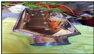
Used Goodparts air housing box for dual 175 CD Stromberg carburetors for TR250 & TR6. $100.00