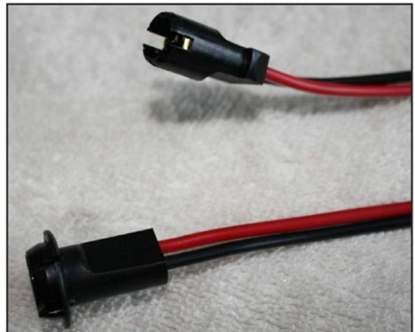
Both the C612 and C614 bulbholders