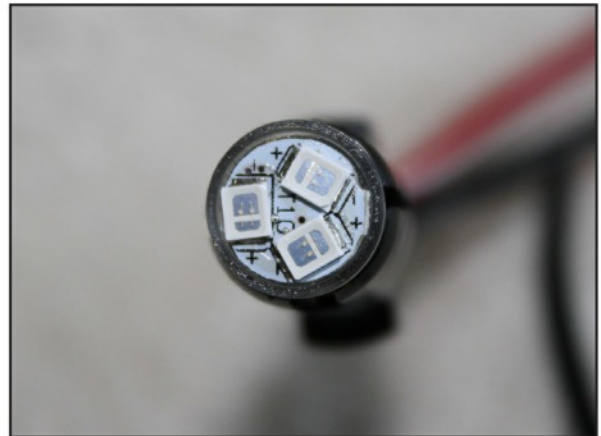
Here is the C614 wired with the push-in LED 194-G3HP bulb.