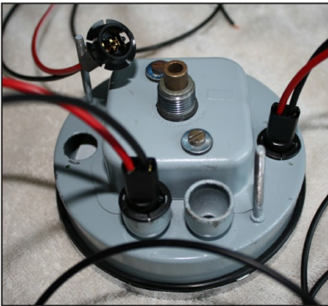
The back of the larger gauge with the C612's in place.