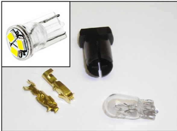
Here is the C614 with the clips and provided LLB504 bulb, the new LED 194-CW3HP shown to the left.