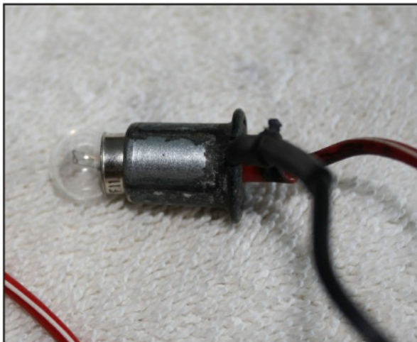
This is my original bulb-holder where my ground wire was only on by a single wire.