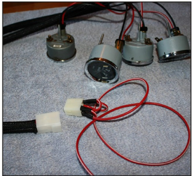
All four smaller gauges with the C614's in place wired to the 4-way spade connector for power.