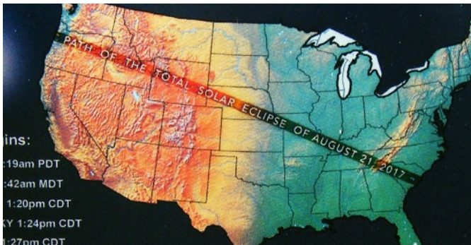
The eclipse path across the US