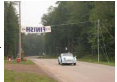
A picture taken from the web showing a TR3 finishing a VTR driving event in over-cast Pennsylvania.

It was a clear and cool morning, though still dark at 5:30 on Saturday, August 2 nd , when I took off for the VTR convention in Armagh, Pennsylvania. A quick stop for gas in Castle Rock, then it was due east for the next two and a half days. First on Colorado 86, a delightfully quick two lane to Limon, then east on I-70 all the way to St. Louis. Nothing remarkable to report about the highway, but a certain lack of scenery, of any kind, led me to observe that road-side mileage markers were going by considerably slower than the one's digit on the odometer. After a number of miles of observation and mental gymnastics, I determined my odometer was approximately 20% off. This made for considerably better miles per gallon calculations once the 20% was factored in! First night's stop was at a Super 8 in Kingdom City, Missouri, just west of St. Louis, which left me in good form to go through St. Louis first thing in the am and view the "upside down letter U," as my children, years earlier, had identified the arch. After St. Louis, I continued east on I-64 to Louisville and West Virginia. I was treated to a steady parade of hot rods, mostly being driven, going in the opposite direction. An encounter with one and resulting conversation at a gas stop revealed that they were returning from THE national hot rod convention in Louisville, some 10,000(?) cars strong. Even allowing for exaggeration, that put VTR in a different perspective!