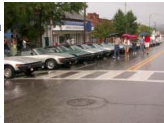
TR8s showing their stuff at a very wet car show in Indiana, PA.