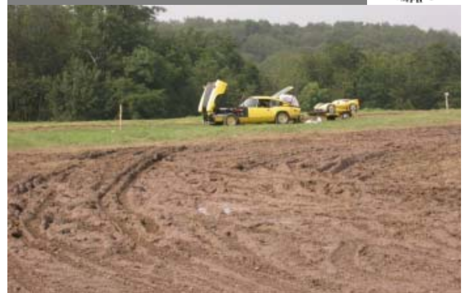
A picture is worth a thousand words. This picture of the field outside of the Roadster Factory is rutted with tractor prints from pulling little British cars from the mud.