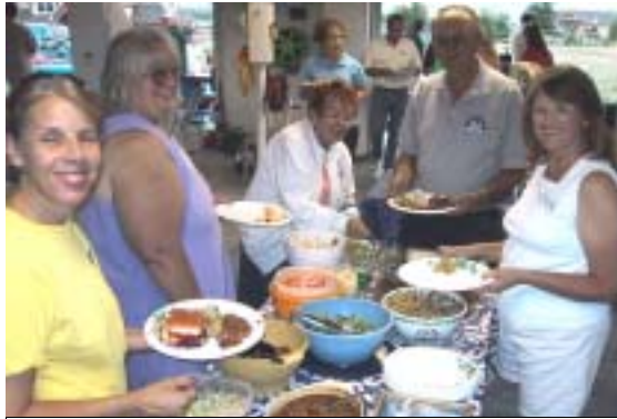
The food and side dishes were fantastic, as you can see from all the smiles.