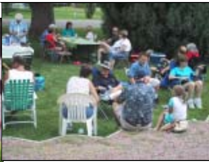
Enjoying lunch on the lawn in Canon City.