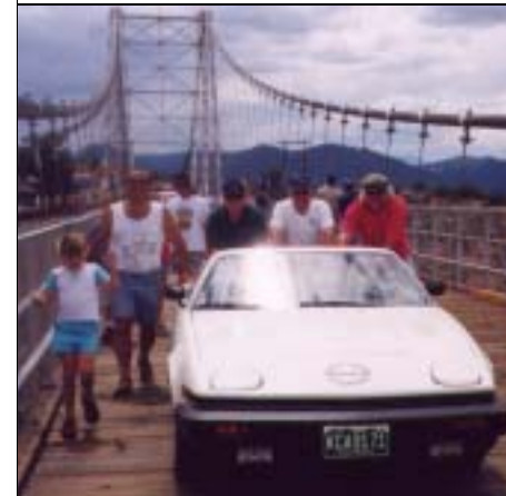
Wide angle shot of Dave's angels.