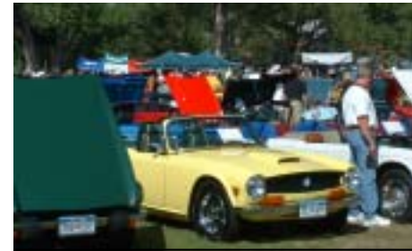
From thought provoking....

recently lower thermometer reading. Having gotten a slower start to the day than I had wished, I raced from the house only to remember I meant to raise the top the previous night — just in case. Problem: it was