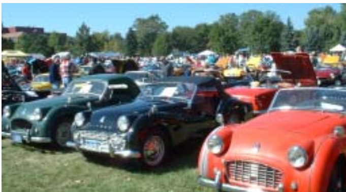
TR2, TR3A and a TR3 bask in the glow of their offspring surrounding them.

too cold to raise it without using a hair dryer. After a very cold, very quick blast to Arvada, we joined up with Rod Tomkins and took off for the Tour. Throughout the day, we drove through Golden Gate Canyon State Park, into Rollins-