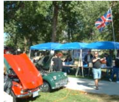
Brooks Turner promenades through the Conclave.

ville, Nederland, Estes Park and ending in Longmont. We experienced nearly all types of precipitation, only to hit a heat wave in Longmont. You'll recall this was the day of a very cold, very heavy arctic front moving into Denver, but we didn't see any of it when we were leaving for home.