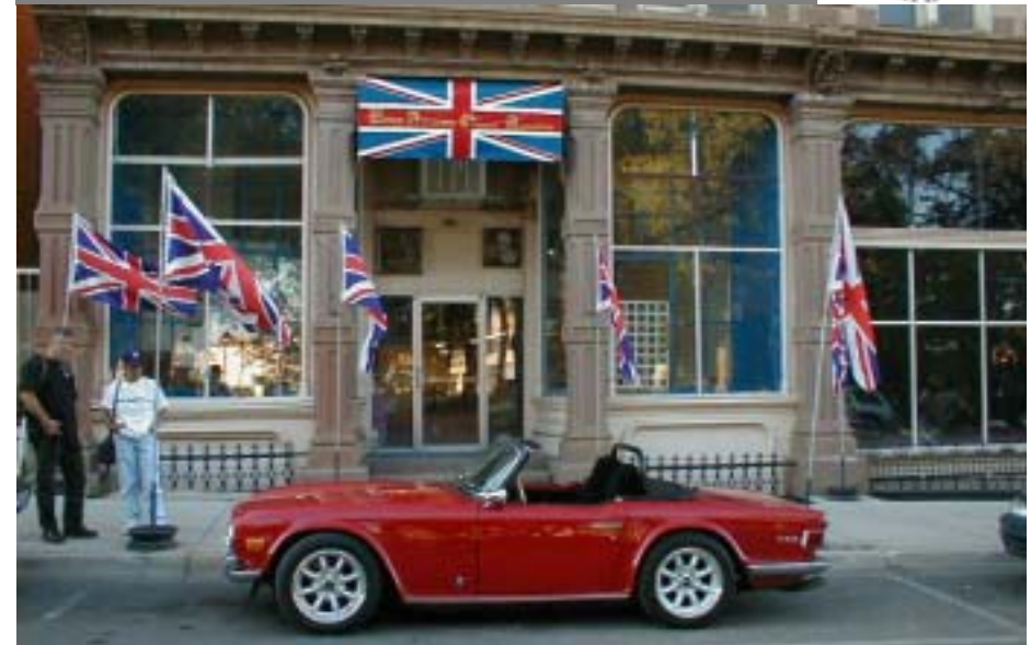
TR6 sitting very regally outside the New Mexico Rendezvous headquarters in Las Vegas, NM.