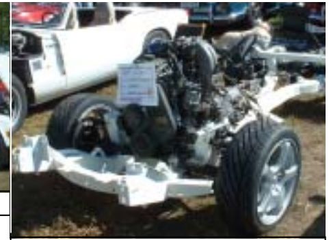
... to awe inspiring ....

ville, Nederland, Estes Park and ending in Longmont. We experienced nearly all types of precipitation, only to hit a heat wave in Longmont. You'll recall this was the day of a very cold, very heavy arctic front moving into Denver, but we didn't see any of it when we were leaving for home.