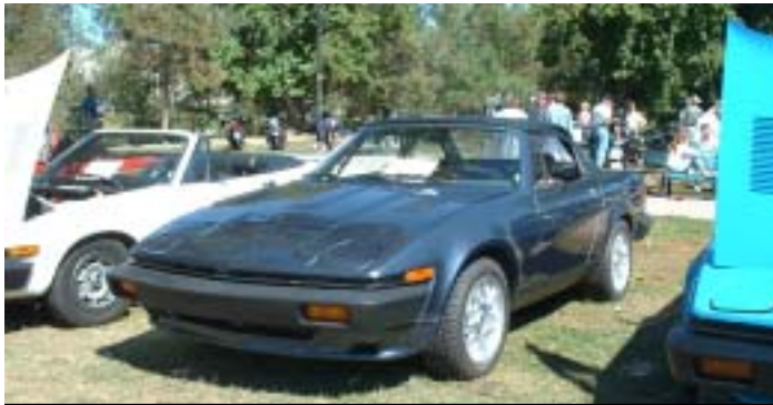
The Cline's weigh in with their next generation TR7.

too cold to raise it without using a hair dryer. After a very cold, very quick blast to Arvada, we joined up with Rod Tomkins and took off for the Tour. Throughout the day, we drove through Golden Gate Canyon State Park, into Rollins-