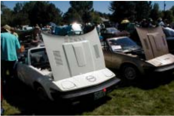
Farrell's and Kalin's TR7 and TR8 (respectively)

galia sales. Also, food donations totaled $697. Of course, these figures are gross. We do have to net out the costs of items to see the revenue to the club.