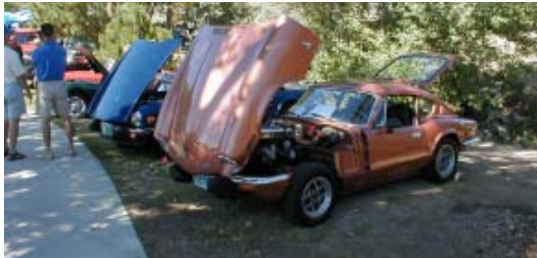
So many Triumphs that we had to park them across the sidewalk from the others.

galia sales. Also, food donations totaled $697. Of course, these figures are gross. We do have to net out the costs of items to see the revenue to the club.