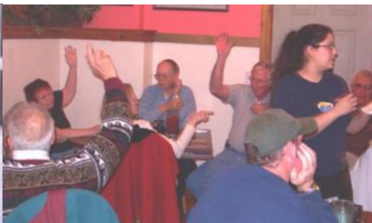
Anybody want a beer?