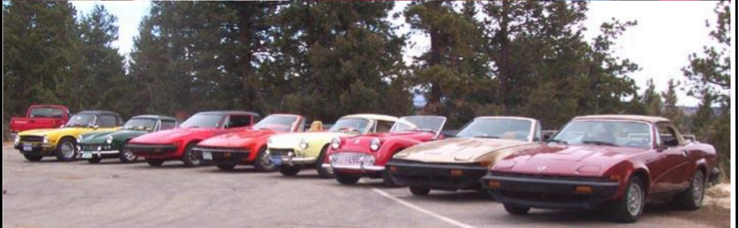
April 3, Breakfast at Red Rocks Grill and Gaggle to Mt. Falcon Park