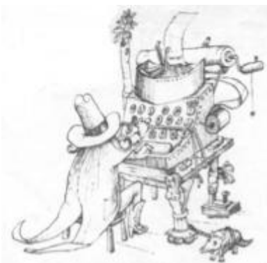
Composed at the Lucas electric typewriter.

Enough already. It's the middle of April and we are still getting spring snow storms. Where else but Colorado would you be mowing your lawn in between snow storms?