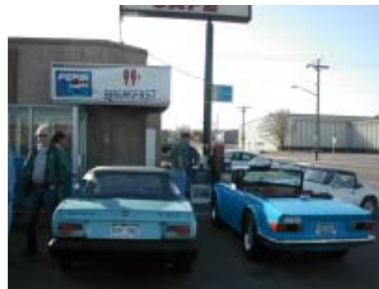
Triumphs waiting outside the café.