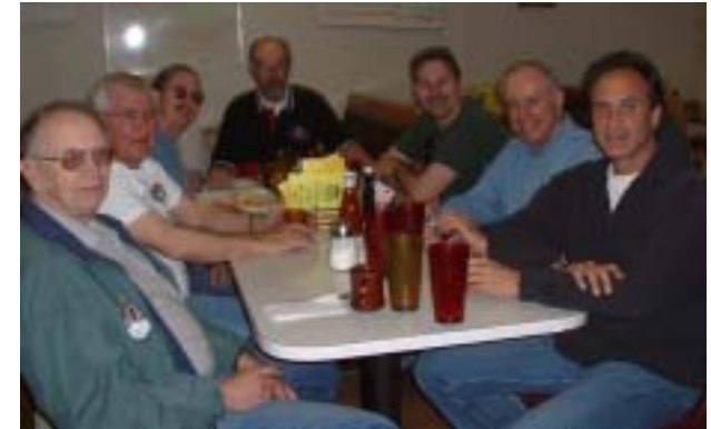
The gang having breakfast at the Butcher Block Café.

The group met at the Butcher Block Café for a great breakfast. The service was excellent, the food was good and it was cheap. What more can you ask. We will be back in the future.