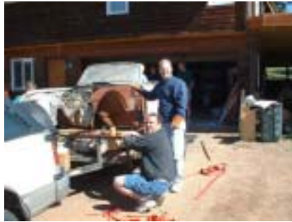
Brooks & Yours Truly cinching.

There is an open invitation to everyone in the club to come by and see the '4. I'll promise to keep the garage fridge stocked with beer and soda.