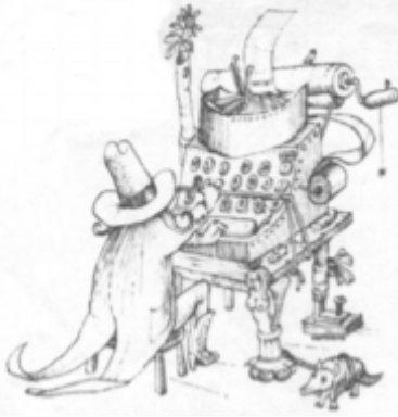
Composed at the Lucas electric typewriter

Good news! Steve Earle and Earl Scruggs will be at Rockygrass this year. Oops, wrong newsletter. Lots of interesting developments this month. The GT6 will be the featured car at the VTR National in Dallas in July. I know there are lots of GT6 's in the club, many of which actually run, so let's have a good turnout from the RMTC. Yeah, Dallas is a bit muggy in July but it's an easy 2 day drive from Denver and the Red River Triumph Club has done this before so we know it will be a quality event.