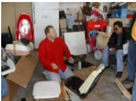
New diaphragm and rear seat foam installed. Next step is bottom seat foam, followed by vinyl.

In the beginning of the session, I passed out copies of