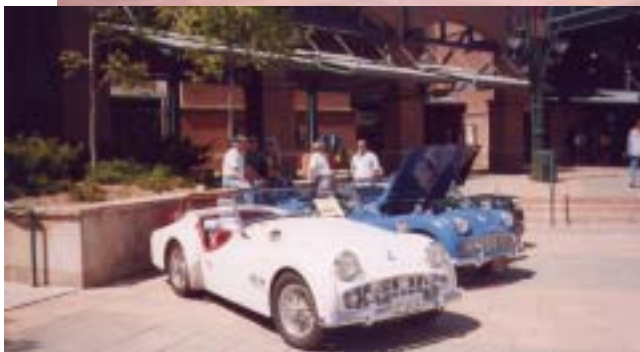
The Deats' TR3A, the Trumpe's TR3A, and the High's TR2 showing off.