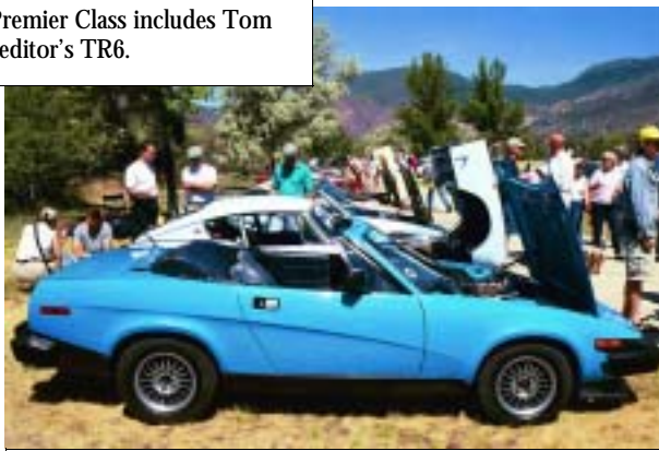
Terry High's TR7 looking great in the Glenwood Show.

ther the funkhana or the car show. We will be rearranging the car show classes next year to accommodate the changes that seem to happen in the different marques that show up every year. There have only been one or two cars in the TR2-3-4-250 class