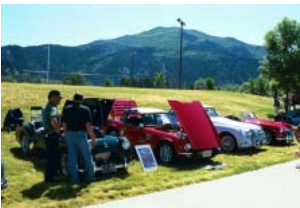
Glenwood Rallye Car Show — Premier Class includes Tom and Dorthy High's TR2 and the editor's TR6.

ther the funkhana or the car show. We will be rearranging the car show classes next year to accommodate the changes that seem to happen in the different marques that show up every year. There have only been one or two cars in the TR2-3-4-250 class