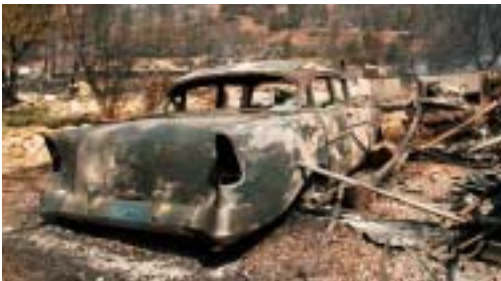
This Chevy was caught in the Coal Seam Fire. Not a rallye participant, but a very sad resident—I'm sure.