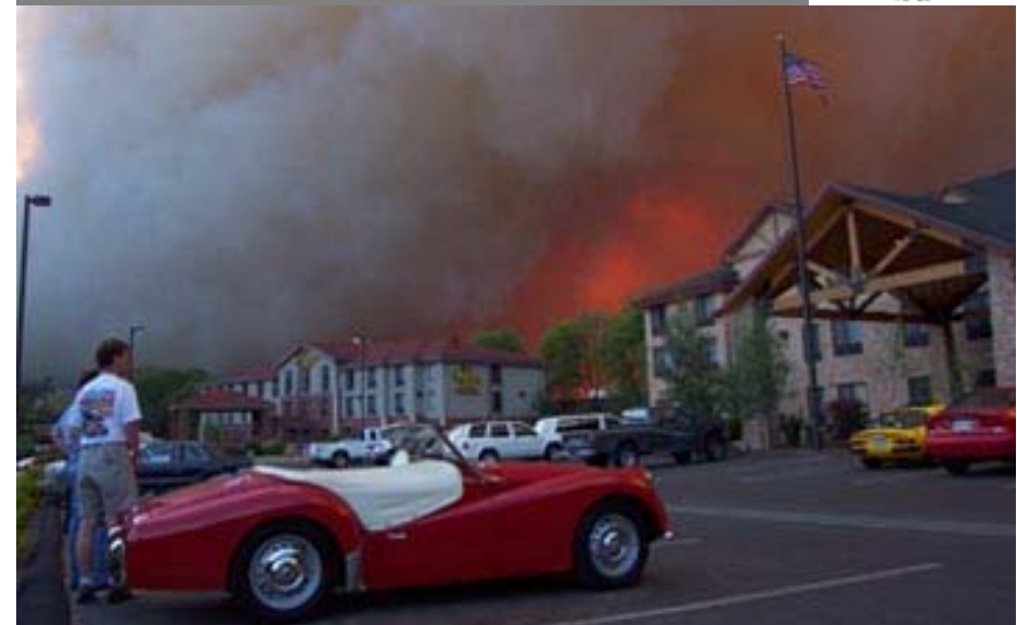
Brooks Turner's TR3A stands in the foreground as smoke and flames dominate the background. The Hampton Inn stands to the right, with the Holiday Inn to the left. Picture taken June 8th, 2002.