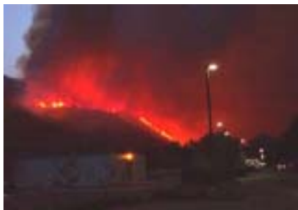
Fantastic shot of the fire at about 9 or 9:30 pm.

had jumped both the Colorado River and I-70, and stories from people evacuating included information about car dealers and shopping malls burning