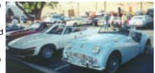
Triumph TRs ready for Tour to Glenwood Springs. Photo at Gunther Toody's.

Beginning Saturday morning, the 50th running of the Glenwood Springs Rallye begins at 9 am. Spirits were high at the start line, with many owners and aficionados of different marques enjoying discussions about classics. Mike Cline and I were the 78th cars to begin; allowing us the opportunity to see many rallyist off. The route was enjoyable, but difficult in parts. Adding to the experience were the mid-nineties and sun forecasted for the day.