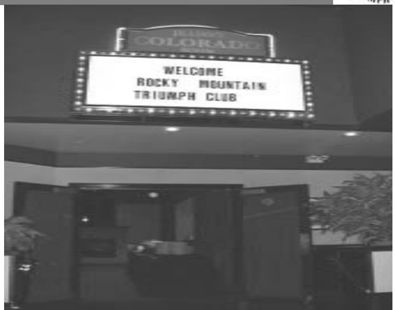
We've always wanted our name up in lights. We're on the Marquee at Jillian's for our January, 2004 Banquet