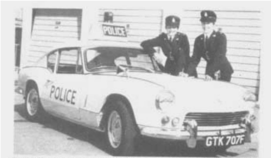
Fig. 5-5. The British police have long had the pleasant habit of using sports cars to chase speeders. So it was no surprise when a pair of lady constables, ended up doing their duty in a 1968 GT-6 and very much enjoying it.