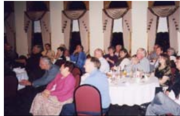
Banquet attendees watching the awards presentation.