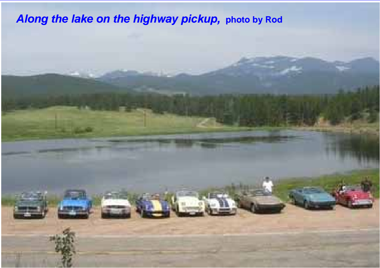
Along the lake on the highway pickup, photo by Rod

Monthly Meeting Place: Piccolo's Monthly Meeting Date: 3rd Tuesday