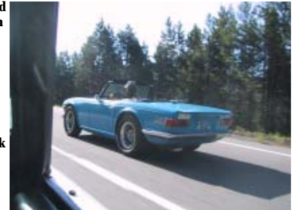
Andy's TR-6 at speed going up Rabbit Ears Pass as seen from Scott's car

Lunch was at the Estes Park Brewery and then down the Peak to Peak highway with a final group stop in Rollinsville . The group agreed the 550 mile drive was delightful with magnificent scenery, good food and great companionship. We thanked Rod for putting it together.