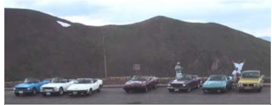
All seven Triumphs in an uncrowded parking lot on Trail Ridge Road

It rained hard during dinner so all of the TR 7 & 8 drivers hurried back to put the tops up on their cars; the TR-6 drivers had put theirs up before dinner. (There must be a message there but I don’t know what it is.)