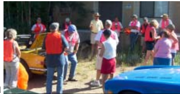
RMTC group receiving instructions at the top-most elevation of

drive to Rollinsville. The drive was fantastic, with numerous Triumphs joining up for a winding drive through the foothills.