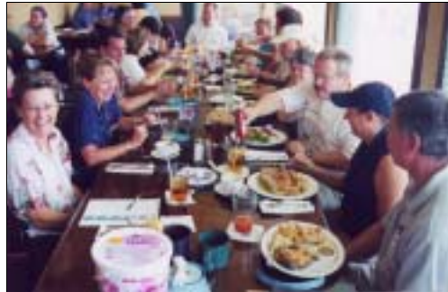
The "gang" enjoying lunch at Phantom Canyon Brewery.