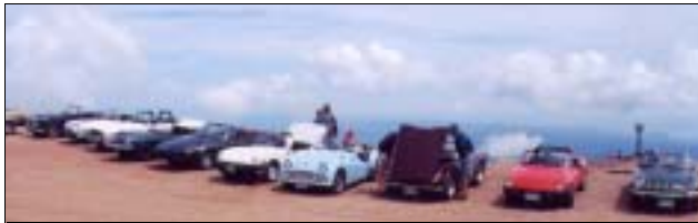
Panoramic photo of those joining the Pikes Peak climb.

the mountain. With everyone at the top we took turns doing wind sprints from the Triumphs to the Peak house to see who could pass out the longest from lack of oxygen, it was a tie between Max and Scott.