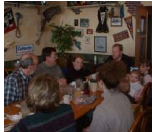
Nono's has great "stuff" hanging on the walls.

We had the entire breakfast menu to choose from, and the dining area to ourselves. The only problems we encountered was slower service than usual — we only had